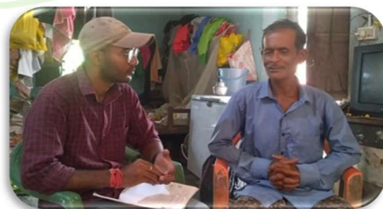
(Interaction with Farmer)

His thoughts are reflected by a single saying that “Self Confidence is the Key to Success” . He says that we shouldn't only focus on working only for Government Services but rather we should focus on chasing those dreams that we will really enjoy doing as we will start enjoying our work , there will come a time when we will be really a successful and a happy soul just like he is today even in his sixties. He urges everyone to do hard work along with new modern Technologies in Time and Team Spirit with family members maintaining Transparency to really achieve something worthwhile.