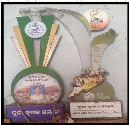
(Best Farmer Award)

To be a truly eco-friendly his farm runs on Integrated Farming System (IFS) as for understanding purpose he grows paddy and